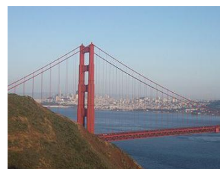
The Golden Gate Bridge

When the bridge opened, drivers had to pay 50 cents to cross the bridge in either direction. Today, when drivers go north on the bridge (leaving San Francisco) they do not have to pay, but starting on September 2, 2008, when going south (entering San Francisco), cars and other vehicles have to pay around $8.